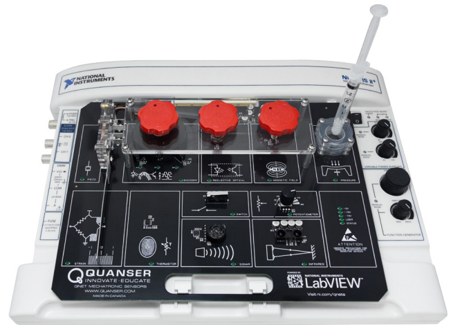
NI Part No. 751423-01

The QNET Mechatronic Sensors board features ten different sensors, including strain gauge, piezo vibration sensor, rotary potentiometer, pressure sensor, thermistor, long range ultrasonic and infrared sensors, short range magnetic field and reflective optical position sensors and encoder; and a snap action switch. Students learn fundamentals of interfacing with these sensors, including how to collect data from sensors, calibrate sensors, and use them to identify natural frequency of material.