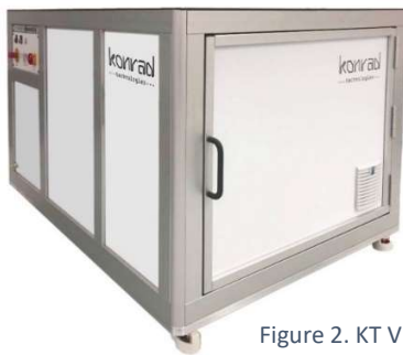
Figure 2. KT VRTS