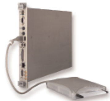
Figure 2. USB Floppy Drive

National Instruments also offers an optional external USB floppy drive for use with the VXIpc-77x embedded controllers (see Figure 2). The floppy drive connects directly through USB and requires no external power. This USB floppy drive is an excellent option for easy software installation or read/write data storage access on a floppy diskette.