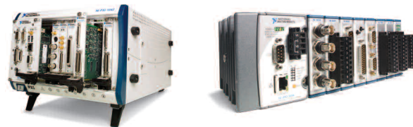
Figure 1. Deploy models to Real-Time PXI or CompactRIO hardware

Step 4. Run the LabVIEW application and analyze the behavior of the model.