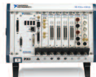
Figure 1. This NI PXIe-8130 controls an 8-slot PXI Express modular instrument and data acquisition system.

The NI PXIe-8130 features an NVIDIA MCP55 Pro chipset. This chipset provides four x4 ("by four") PCI Express lanes that are forwarded to the PXI chassis backplane to create four x4 PXI Express slots. Each of these slots has up to 1 GB/s of dedicated bandwidth with the overall system bandwidth of up to 4 GB/s.