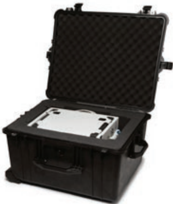
Figure 3. NI PXI Carrying Case Accessory