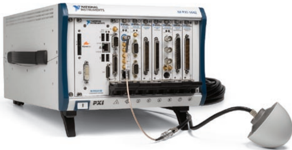
Figure 1. The PXI-6682 is connected to an active GPS antenna and installed in a system timing slot (slot 2) of an NI PXI-1042 chassis.

The PXI-6682 provides full control of the timing and synchronization features of the PXI backplane (Figure 3). To act as a PXI star trigger controller or to offer a high-accuracy, free-running 10 MHz reference clock, the PXI-6682 must be installed in slot 2 of the PXI chassis, as shown in Figure 1. It is capable of routing signals to and from the front panel, the PXI star triggers, and the PXI triggers. In addition, you can invert the polarity of the destination signal, which is useful when handling active-low digital signals. The PXI-6682 can also route a 10 MHz clock from CLKIN to the PXI 10 MHz reference clock and route the TCXO or PXI 10 MHz reference clock to CLKOUT. Refer to Figure 2 for the PXI-6682 functional block diagram.