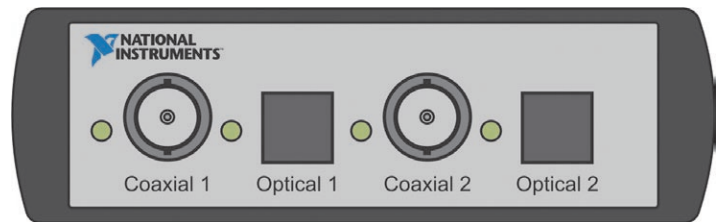
Figure 2. The NI CB-2180 digital audio accessory provides two digital audio input channels. Each channel has a software-selectable BNC for coaxial or TOSLINK for optical connection.

1 Software-selectable on each channel independently