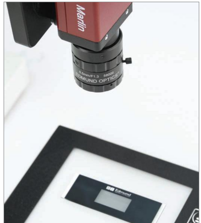
Ronchi Ruling Comparison Test Setup

Shown below are comparisons of our TECHSPEC® Compact Fixed Focal Length Lens at the center and the corner of the images to the performance of various competitor lenses. Edmund Optics® lenses show a 30% increase in contrast over the closest competitor at the center of the image. Additionally, Edmund Optics® lenses show over twice the contrast in the corner making our Compact Fixed Focal Length Lens ideal from the most simple to the most complex applications. All tests are done with a 16mm lens at f/2 on a 1.3MP, 1/2" sensor camera and 1.5" field of view.