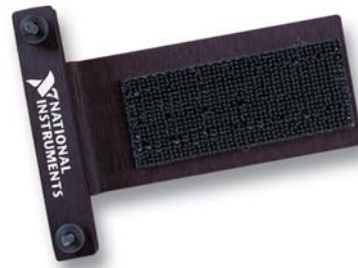
Figure 3. PCMCIA Cable Strain Relief Kit