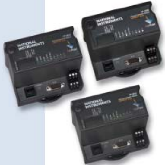
FieldPoint Real-Time Ethernet Controller Interfaces