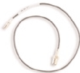
Figure 4. SMB 100 Cable