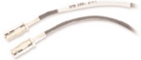
Figure 6. SMB 200 Cable