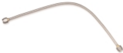
Figure 3. SMA 100 Cable