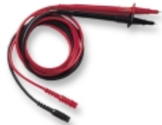
Figure 8. P-1 Probe Set