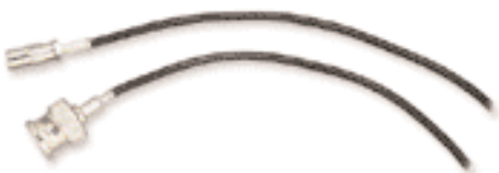
Figure 5. SMB 110 Cable