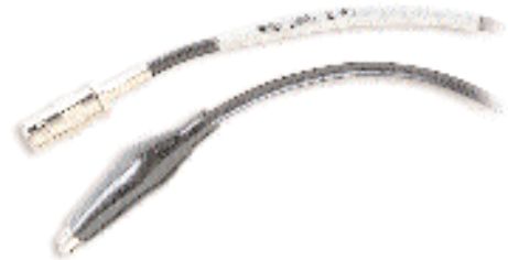
Figure 7. SMB 300 Cable