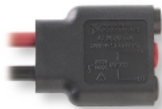
Figure 9. Current Shunt