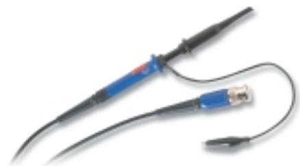
Figure 10. SP200B