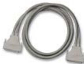
Figure 13. SH100-100-F Shielded Cable