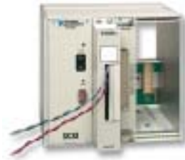
Figure 1. SCXI High-Performance Signal Conditioning

SCXI is a modular high-performance signal conditioning system that serves as a front end to your digital I/O device. The SCXI modules for digital I/O offer isolation, extended voltage ranges (up to 250 V rms ), increased current switching capabilities, and expanded channel counts (up to 3,072 I/O lines). In addition to SCXI modules for digital I/O, your SCXI signal conditioning system can include modules for analog outputs and general-purpose switching when cabled to a digital I/O device. With SCXI, you can create integrated, flexible high-channel-count measurement systems with signal conditioning components tailored to your needs. See page 246 for details on SCXI signal conditioning.