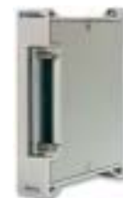
Figure 5. TB-2715 Terminal Block

Dimensions – 8.43 by 10.41 by 2.03 cm (3.32 by 4.1 by 0.8 in.)