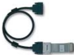
Figure 14. PSHR68-68-D1 Shielded Cable Kit