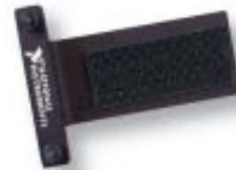
Figure 23. PCMCIA Strain-Relief Accessory