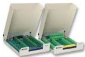
Figure 4. SCB-68 and SCB-100 Shielded Connector Blocks

Dimensions – 19.5 by 15.2 by 4.5 cm (7.7 by 6.0 by 1.8 in)