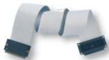
Figure 18. PR68-68F Ribbon Cable