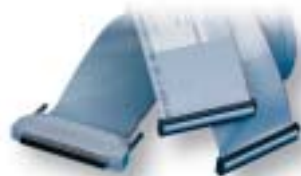
Figure 17. R1005050 Ribbon Cable