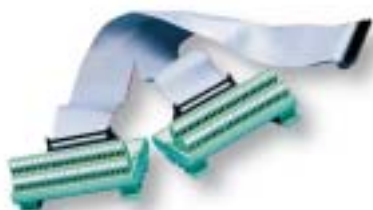
Figure 10. CB-100 I/O Connector Kit