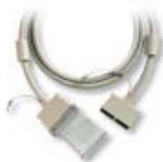
Figure 12. SH50-50 Shielded Cable