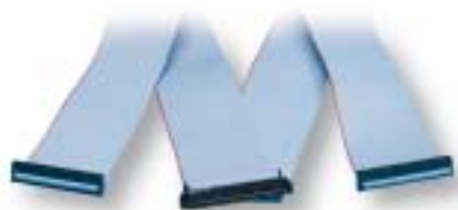
Figure 20. NB5 Cable