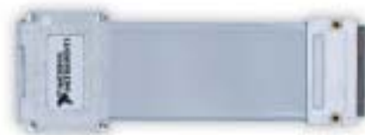
Figure 15. PSHR68-68M Shielded Cable