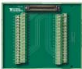
Figure 6. TBX-68 I/O Connector Block