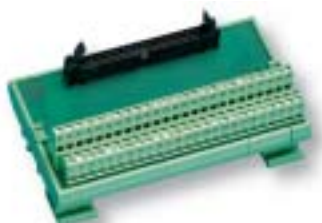
Figure 8. CB-50 I/O Connector Block