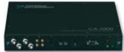
Figure 3. CA-1000 Configurable Signal Connectivity Solution