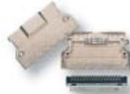
Figure 21. 68-Pin Custom Cable Kit