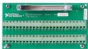
Figure 9. CB-50LP I/O Connector Block