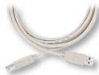
Figure 24. USB Cable