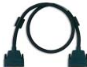
Figure 11. SH68-68-D1 Shielded Cable