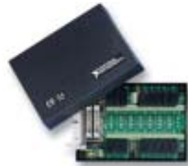
Figure 2. Digital Signal Conditioning Accessories

National Instruments offers several options for low-channel-count digital signal conditioning. These accessories, such as SCC, provide a cost-effective solution for low-channel-count digital I/O systems requiring isolated I/O or relays for controlling external devices. Most of these products cable directly to your National Instruments digital I/O device. See page 347 for details on digital signal conditioning accessories.