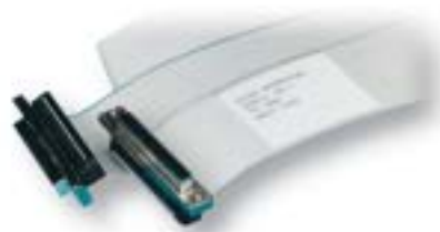
Figure 16. R6868 Ribbon Cable