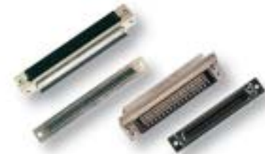
Figure 22. PCB Mounting Connectors