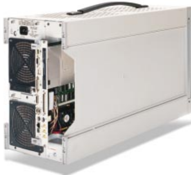
VXI-1200 FlexFrame - Back View

If you wish to control a FlexFrame System from a desktop computer using a MXI-2 interface, the VXI-MXI-2/B delivers the same performance as the standard C-Size interface but at a lower cost. Using the VXI-MXI-2/B in the back of the FlexFrame, you can use all size C-size VXI slots located in the front of the chassis for instruments. The smaller size and the absence of EMI shielding reduce the cost of the B-size VXI-MXI-2 versus the C-size module. EMI shielding is required for C-size instrument and control modules but not for B-size. Because of the FlexFrame design, you simply insert the VXI-MXI-2/B into the leftmost B-size slot located in the rear of the FlexFrame to physically isolate the VXI-MXI-2/B from the C-size instruments, eliminating potential EMI problems.