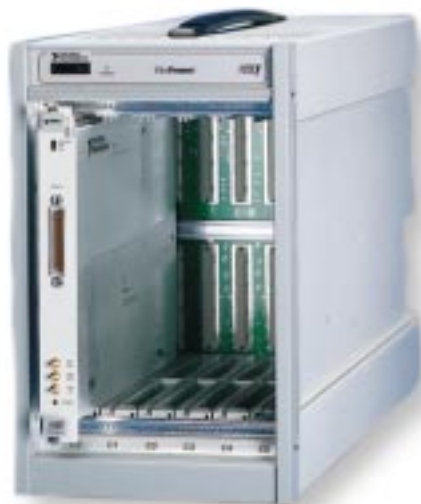
VXI-1200 FlexFrame - Front View