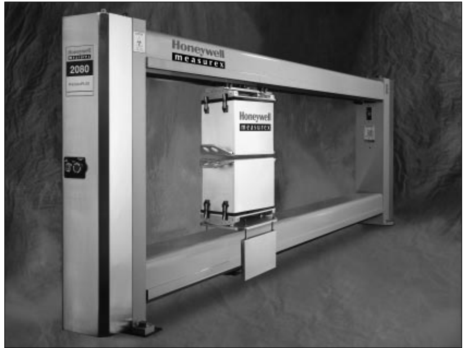
Honeywell-Measurex MXProLine On-Line Measurement and Control System with the 2080 Scanner/Sensor

Because we wanted control and applications engineers knowledgeable in the end-use of our systems to develop the software, we ruled out C, C++, and other conventional languages. In addition, we excluded interpreted languages